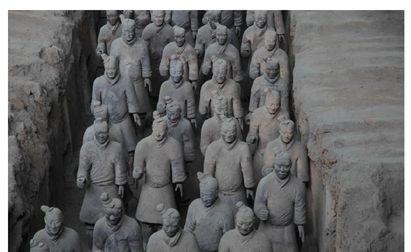
Terracotta Soldiers, Xi'an, China