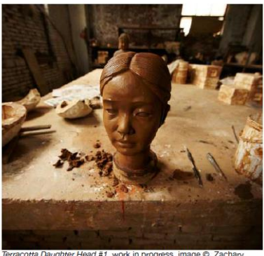
Terracotta Daughter Head #1, work in progress, image © Zachar