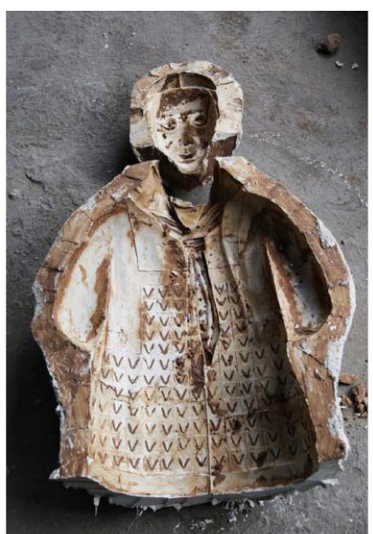
Mold combinations based on the 8 originals, image © Prune Nouny